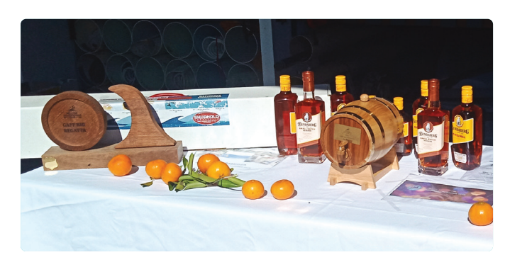
The legendary Bundaberg rum, produced three hours north from Noosa since 1882. We will have to race again next year to be awarded the first prize 4lt barrel of rum!