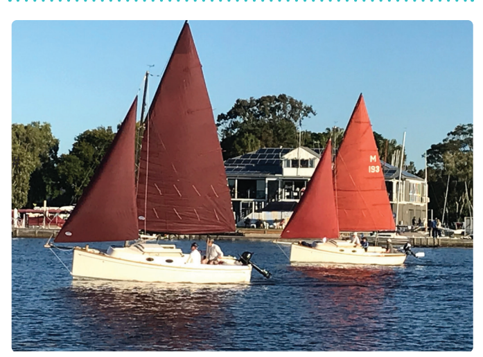
Close end between Darryl (#14) (front) and Cygnet (#1) at the end of race number 3.

Overall Cygnet 20's placed 2<sup>nd</sup>, 3<sup>rd</sup>, 4<sup>th</sup> and 5<sup>th</sup>. The winner of the regatta, a French sailor, won all three races with an O'Day 20, Petit Bateau. Everyone received a prize of Bundaberg rum and Cygnet owners an extra bottle of wine each. The Gaff Rig Regatta profits ($600) was donated to Sailability, the Club charity.