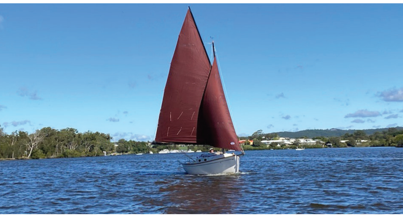
Darryl on No name yet happily sailing on lake Cooroibah and Noosa river.