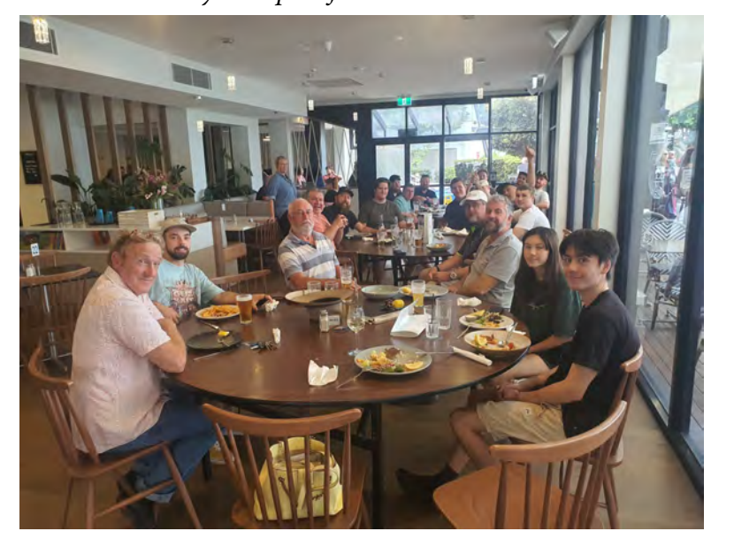
2022 Staff Christmas Party