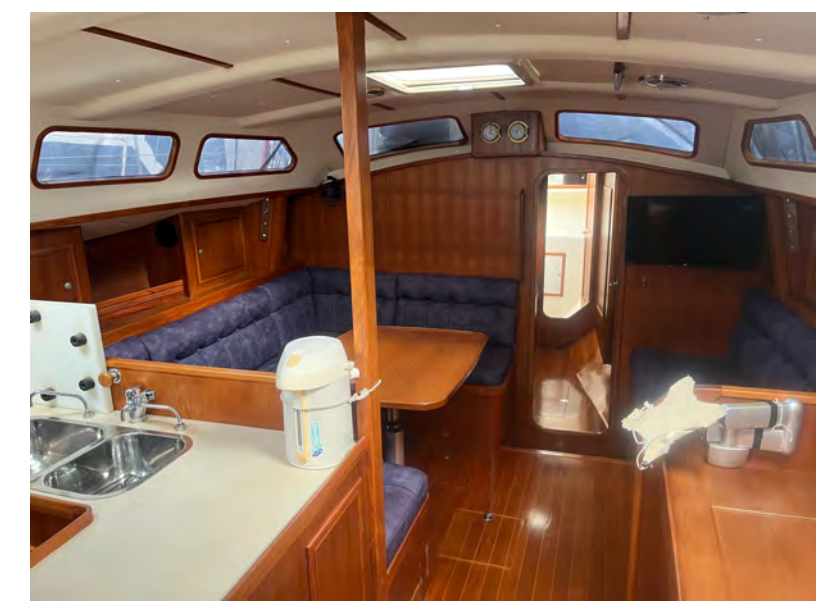
Interior Quo Vardis