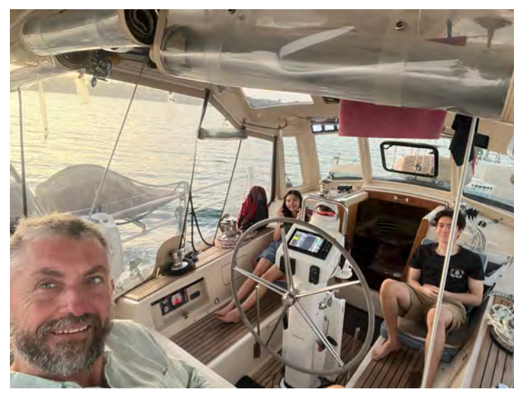
China Girl cruising Lake Macquarie with the kids