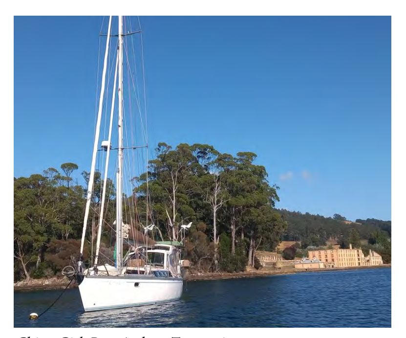
China Girl, Port Arthur, Tasmania

n a personal note I have enjoyed using Bluewater's, firstly, sailing China Girl to Hobart then a circumnavigation of Tasmania, then back again plus the many trips away on Cygnet racing and cruising. I look forward to sailing to New Caledonia this year as well catching up with the many Cygnet owners throughout the year with organised events.