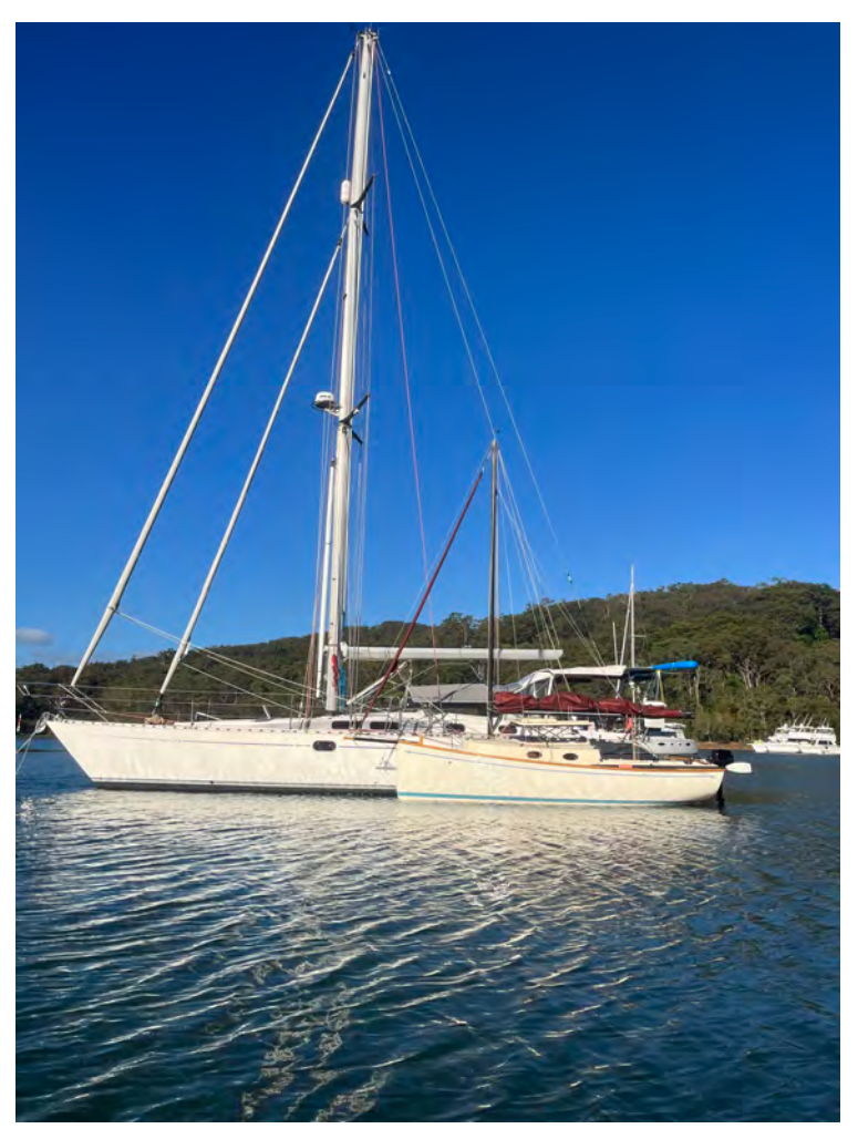
Fame Cove Port Stephens