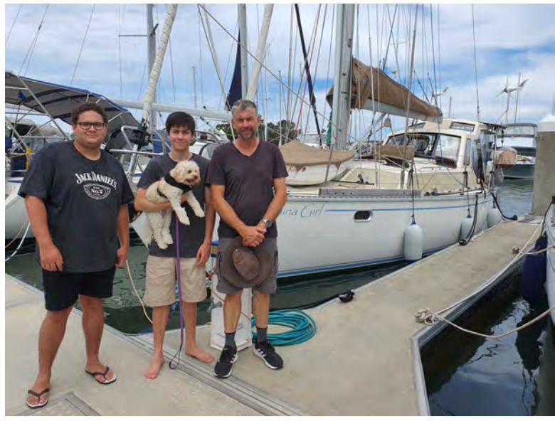
China Girl ready to depart for Hobart