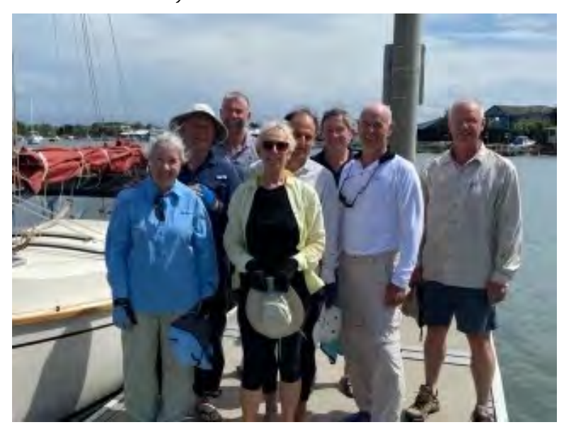
Southport Raid 5 Cygnets

I would like to give a big thank you to all our magnificent staff at Bluewater, their quality and attention to detail is second to none. There are too many to name individually but our designer, office manager, shipwrights, fiberglassers, cabinet makers, apprentices and Exodus craftsmen have turned raw materials into exciting escape machines for our lucky customers to enjoy both on land and sea. Thank you to all of our customers past, present and future who allow me to live my dream to serve and enjoy our Bluewater's together.