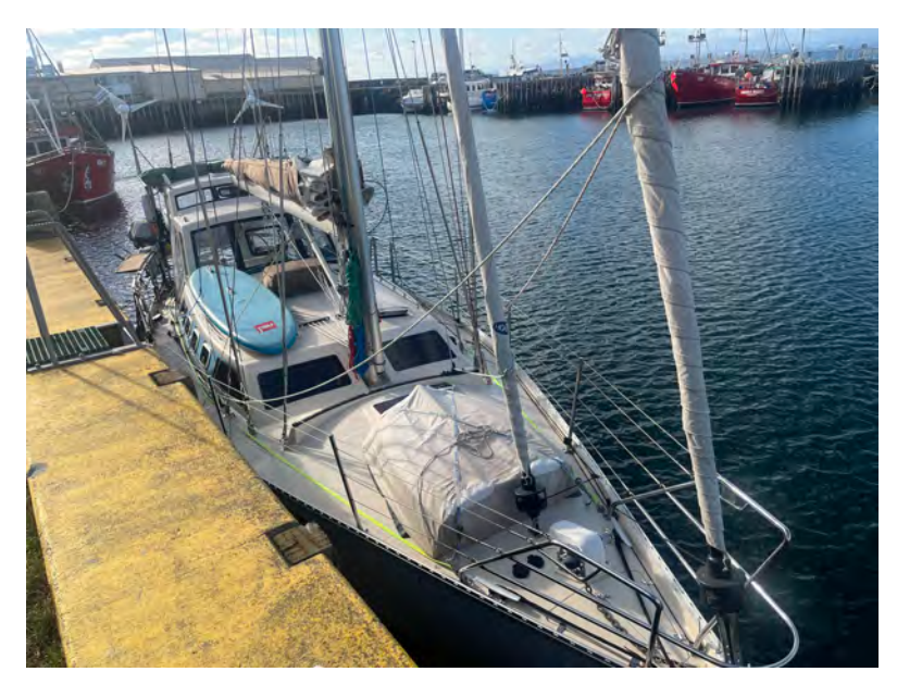
China Girl, Stanley, Tasmania