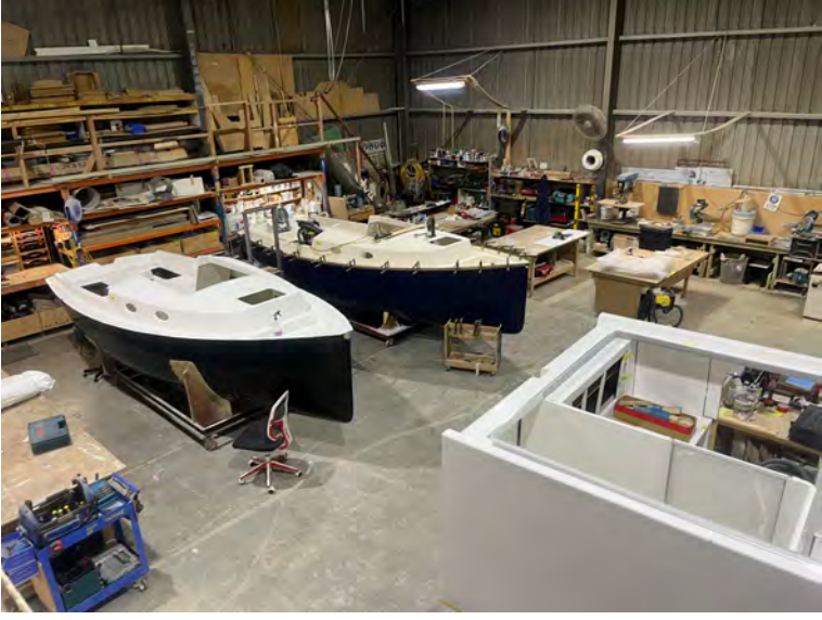
Cygnet 20s on the build